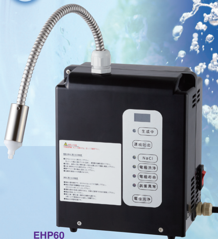
EHP60 Slightly acidic hypochlorous acid water generator

Effectively eliminates viruses and bacteria